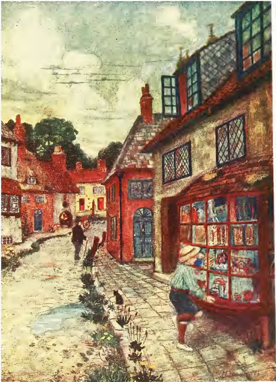
"SHOPS CAME FIRST OF COURSE ...."